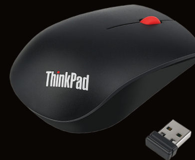
◀ ThinkPad Essential Wireless Mouse