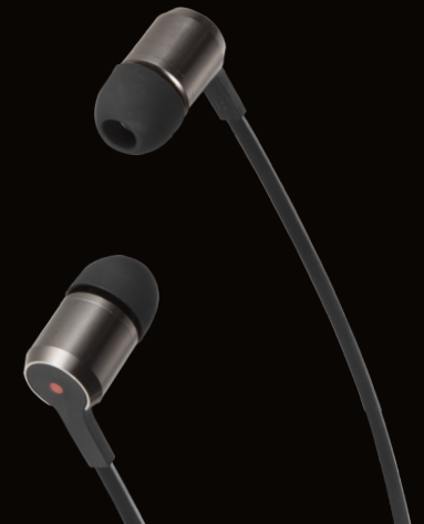
Lenovo In-ear ▶ Headphones