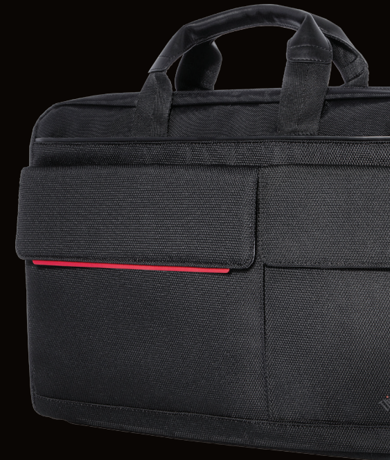
Lenovo Professional ▶ Topload Case