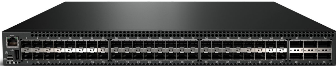
Figure 1. Lenovo RackSwitch G8272

The RackSwitch G8272 is ideal for latency sensitive applications, such as high-performance computing clusters and financial applications. In addition to the 10 Gb Ethernet (GbE) and 40 GbE connections, the G8272 can use 1 GbE connections. The G8272 supports the newest protocols, including Data Center Bridging/Converged Enhanced Ethernet (DCB/CEE) for Fibre Channel over Ethernet (FCoE), iSCSI and network-attached storage (NAS). The RackSwitch G8272 is shown in the following figure.