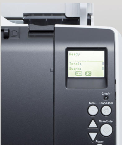
Integrated backlight enhanced LCD operating panel

A backlight enhanced LCD screen within the operating panel puts instant information at your fingertips, including scanner settings, operating status, interaction hints and a paper counter. Also, selecting from the user panel pre-defined scanning routines created with the powerful PaperStream Capture solution included in the package, is a breeze.