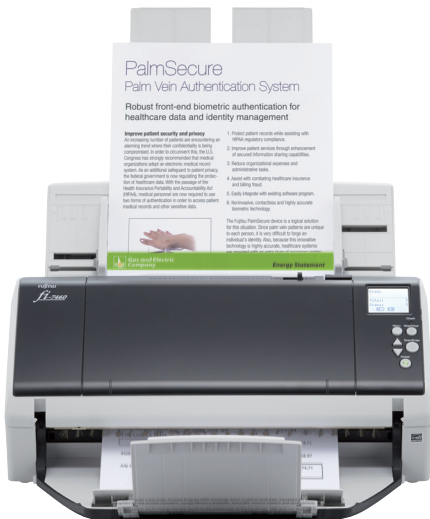
fi-7460 – A4 Portrait at 200/300 dpi 50 ppm / 100 ipm fi-7480 – A4 Portrait at 200/300 dpi 65 ppm / 130 ipm Scan mixed batches; place up to 100 sheets at a time; add sheets while scanning.

High speed performance through USB 3.0 interface, ideal for large format image capture and PaperStream powered multi-streaming, creating up to three separate images of each document simultaneously without delays.