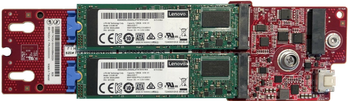
Figure 3. SATA/NVMe M.2 Module with 2 drives

The following figure shows the SATA/NVMe M.2 Module with two 128 GB M.2 drives installed. Note that the production M.2 Module has a green circuit board, not the red color as shown here.