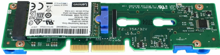
Figure 2. Single M.2 Adapter and a 32 GB M.2 drive

The Single M.2 Adapter is shown in the following photo, with the 32GB M.2 drive installed.