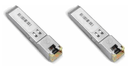
Figure 5. Cisco Copper Gigabit Ethernet SFP

To enable even more cabling flexibility, the Cisco MDS 9000 family offers a copper Gigabit Ethernet SFP. Based on the 1000BASE-T standard, the Cisco Copper Gigabit Ethernet SFP (Figure 5) provides cost-effective connectivity for data center applications. The Cisco Copper Gigabit Ethernet SFP (part number DS-SFP-GE-T) allows a user to use standard Category-5 unshielded twisted pair (UTP) cabling for Ethernet connectivity.