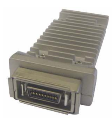
Figure 7. Cisco 10-Gbps Fibre Channel CX4 X2 Transceiver (Part Number DS-X2-FC10G-CX4)