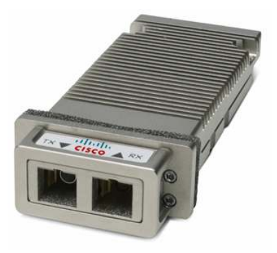
Figure 6. Cisco 10-Gbps Fibre Channel X2 Transceiver (Part Numbers DS-X2-FC10G-SR, DS-X2-FC10G-LR, and DS-X2-FC10G-ER)

The Cisco Fibre Channel X2 transceivers are designed to provide high-performance Fibre Channel connectivity for the 10-Gbps Fibre Channel ports on the Cisco MDS 9000 family platform. There are three types of Cisco 10-Gbps Fibre Channel X2 transceivers for transmission on optical cables: Cisco Short Reach (up to 300 m; part number DS-X2-FC10G-SR), Cisco Long Reach (up to 10 km; part number DS-X2-FC10G-LR), and Cisco Extended Reach (up to 40 km; part number DS-X2-FC10G-ER) (Figure 6). There is also a 10-Gbps Fibre Channel X2 transceiver for transmission on copper cable (up to 15 m; part number DS-X2-FC10G-CX4) (Figure 7). Each product offers 10-Gbps Fibre Channel connectivity.