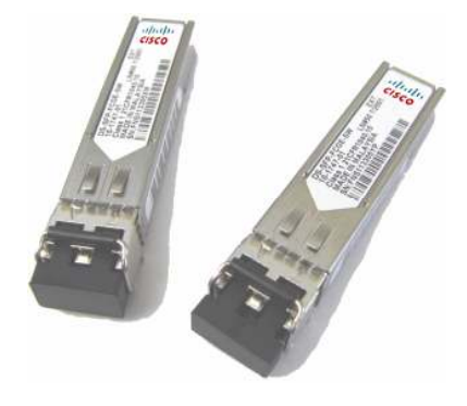
Figure 2. Cisco 4-Gbps Fibre Channel SFPs

The Cisco 4-Gbps Fibre Channel SFPs (Figure 2) are designed to provide cost-effective Fibre Channel connectivity for the 1/2/4-Gbps ports on the Cisco MDS 9000 family platform. There are three types of Cisco 4-Gbps Fibre Channel SFP: the Cisco Fibre Channel Shortwave SFP (part number DS-SFP-FC4G-SW), the Cisco 4-km Fibre Channel Longwave SFP (part number DS-SFP-FC4G-MR), and the Cisco 10-km Fibre Channel Longwave SFP (part number DS-SFP-FC4G-LW). Each product offers 1/2/4-Gbps autosensing Fibre Channel connectivity.