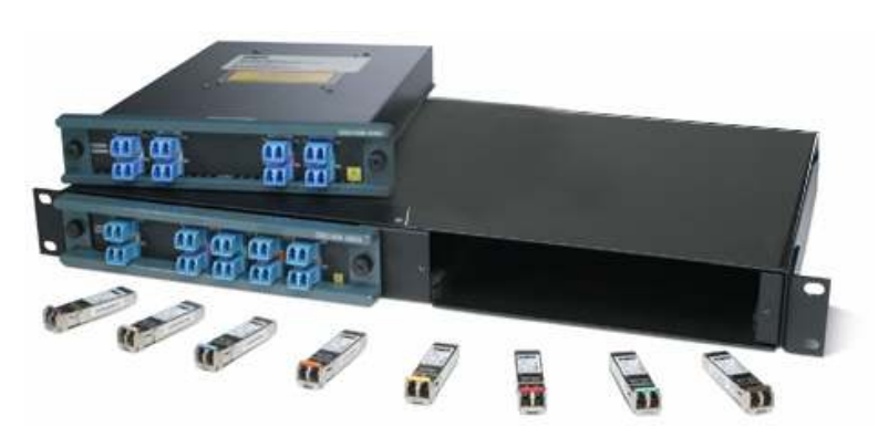
Figure 9. Cisco CWDM Extended Distance SFP Solution

The Cisco MDS 9000 family offers cost-effective multiprotocol extended distance connectivity that optimizes the use of a customer's existing optical infrastructure through the Cisco Coarse Wavelength-Division Multiplexing (CWDM) SFP solution (Figure 9). The Cisco CWDM SFP solution has two main components: a set of eight wavelength-specific SFPs and a set of CWDM optical add-drop modules (OADMs). A Cisco CWDM chassis enables rack-mounting of up to two Cisco CWDM OADMs. The Cisco CWDM OADMs are passive and require no power or configuration.