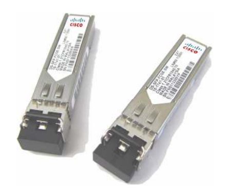
Figure 1. Cisco 2-Gbps Fibre Channel SFPs