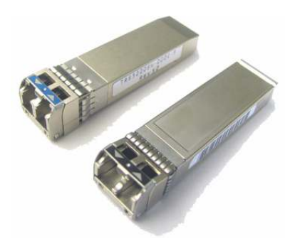
Figure 3. Cisco 8-Gbps Fibre Channel SFP+

The Cisco 8-Gbps Fibre Channel SFP+ (Figure 3) is designed to provide Fibre Channel connectivity for the 2/4/8-Gbps ports on the Cisco MDS 9000 family platform. There are two types of Cisco 8-Gbps Fibre Channel SFP+: the Cisco Fibre Channel Shortwave SFP+ (part number DS-SFP-FC8G-SW) and the Cisco Fibre Channel Longwave SFP+ (part number DS-SFP-FC8G-LW). Each product offers 2/4/8-Gbps autosensing Fibre Channel connectivity.