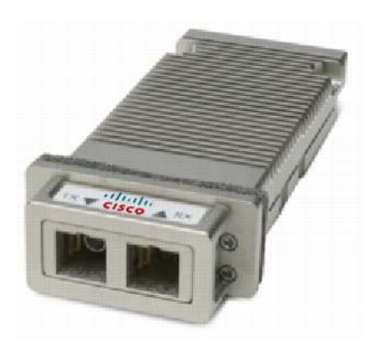
Figure 8. Cisco 10-Gbps Ethernet X2 Transceiver