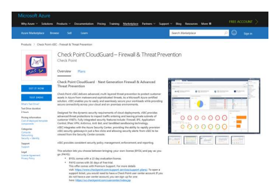
Check Point CloudGuard Security Gateway on Azure Marketplace

Easily and affordably extend security to your Azure cloud using rapid one-click deployment of CloudGuard, available in the Azure Marketplace in on-demand perhour (PAYG) or Bring Your Own License (BYOL) options. Rapidly deploy and provision CloudGuard using Azure Resource Manager templates and quickly customize security protections to your specific business needs using Check Point's advanced threat prevention suite of security technologies.