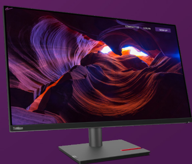
ThinkVision P32p-30 Display