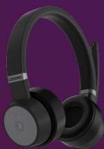
Lenovo Go Wireless ANC Headset