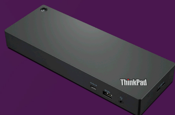
ThinkPad Workstation Thunderbolt™ 4 Dock