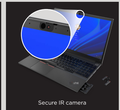
Secure IR camera