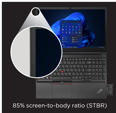
85% screen-to-body ratio (STBR)