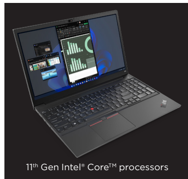
11 th Gen Intel® Core™ processors

Accessorize your laptop by connecting to multiple devices through a range of input/output ports. Speed up your transfers to as much as 40Gbps with Thunderbolt™ 4 port. Multiple ports such as USB 3.1, USB 2.0, HDMI, and RJ45 let you connect to a range of peripherals. Save time and enable efficiency with Windows 11—minimize windows and apps on the external monitor to the taskbar when you disconnect and restore automatically when you reconnect.