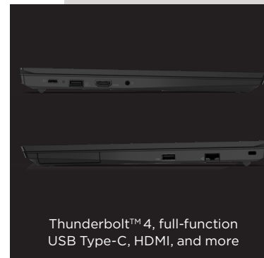
Thunderbolt™ 4, full-function USB Type-C, HDMI, and more