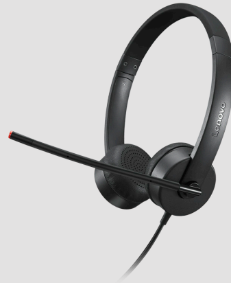
Lenovo Essential Stereo Analog Headset PN: 4XD0K25030

A casual, stylish backpack, it is made of a durable, high quality water repellent fabric. It's large carrying capacity makes it perfect for 15 inch laptops and has many conveniently placed compartments and pockets.