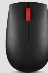
Lenovo Essential Wireless Compact Mouse PN: 4Y50R20864

This headset is comfortable, durable and affordable for everyday use. The comfort fit earpieces and adjustable headband make it easy to wear day-in and out. The 180 degree mic with boom arm ensures clear vocals every time, and is VoIP optimized.