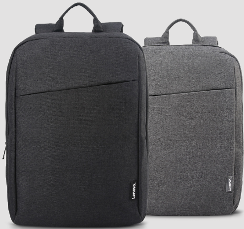
Lenovo 15.6 inch Laptop Backpack B210 PN: 4X40T84059 (BLACK), 4X40T84058 (GREY)

A casual, stylish backpack, it is made of a durable, high quality water repellent fabric. It's large carrying capacity makes it perfect for 15 inch laptops and has many conveniently placed compartments and pockets.