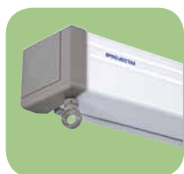
Professional quality manual projection screen