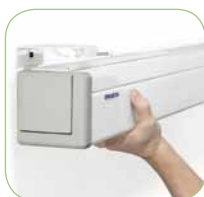
Easy Install with metal brackets