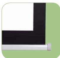
Triangular slat bar retracts into the case