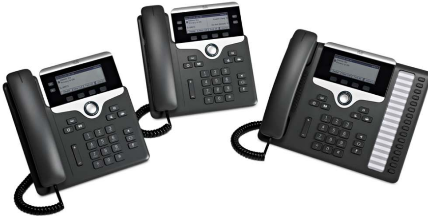
Figure 1. Cisco IP Phone 7800 Series

The line keys on each model are fully programmable. You can set up keys to support either lines, such as directory numbers, or call features like speed dialing. You can also boost productivity by handling multiple calls for each directory number, using the multi-call per-line appearance feature. Tri-color LEDs on the line keys support this feature and make the phone simpler and easy to use.