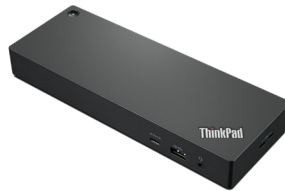
ThinkPad Universal Thunderbolt™ 4 Dock