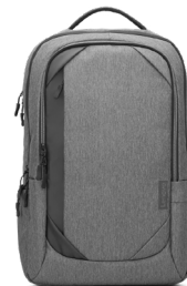
Lenovo Business Casual 17-inch Backpack