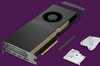
NVIDIA RTX™ A4500 Graphics Card