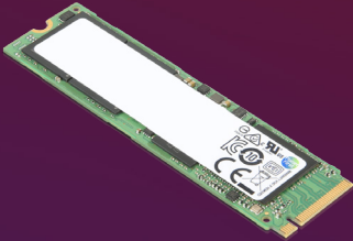
2TB Performance PCIe Gen4 NVMe OPAL2 M.2 2280 SSD