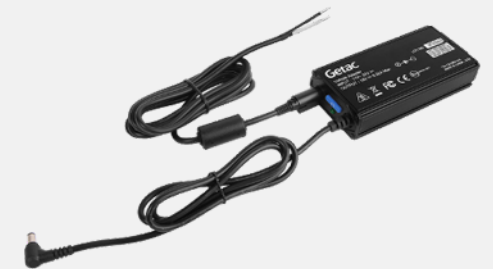
Bare Wire Version