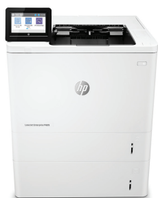
HP LaserJet Enterprise M609x