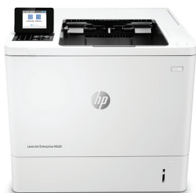
HP LaserJet Enterprise M609dn

This HP LaserJet Printer with JetIntelligence combines exceptional performance and energy efficiency with professional-quality documents right when you need them – all while protecting your network from attacks with the industry's deepest security.