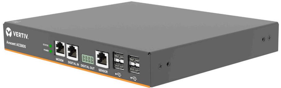
Avocent® ACS 800 Serial Console for the Edge

The Avocent ACS 800 serial console system takes our renowned enterprise class technologies utilized in data centers around the world and packages the key features into an exciting compact and cost effective form factor. Providing serial access, environmental monitoring, IoT integration and remote networking capability to the Edge oriented market sectors of financial institutions, retail chains, education and others.