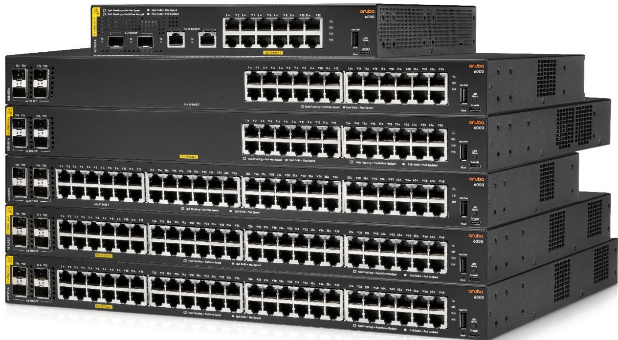
HPE Aruba Networking CX 6000 Switch Series

The HPE Aruba Networking CX 6000 Switch Series is easy to deploy and use with flexible management choices that include Web GUI, CLI, cloud based and on-premises HPE Aruba Networking Central management, so you can choose the best fit for your business and network environment. Delivering Layer 2 capabilities with enhanced access security, traffic prioritization, and IPv6 support, the CX 6000 also simplifies ownership and brings peace of mind with switch software embedded with no subscription required to enable and a Limited Lifetime Warranty.