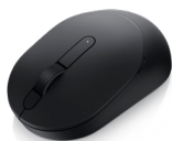
Dell Mobile Wireless Mouse - MS3320W

Collaborate confidently with this 2K QHD webcam that's essential for everyday use.