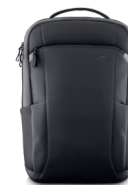
Dell EcoLoop Pro Slim Backpack 15 - CP5724S

Featuring the widest variety of ports available 5 , the compact 7-in-1 Dell USB-C Mobile Adapter - DA310 offers video, network, data connectivity, and up to 90W power pass-through for your laptop 6 .