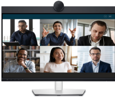
Dell 24 Video Conferencing Monitor - P2424HEB

Experience clear communication with this wireless AI-based noise cancellation headset, designed with a focus on productivity and comfort for all day conferencing.