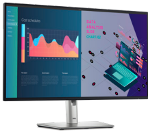
Dell 27 Monitor - P2725H

As the world's #1 monitor company 1 , Dell knows that the modern workplace requires more than PCs. We offer 200+ branded accessories to keep you connected and collaborative no matter your work style. Dell recommended solutions are designed and tested to connect seamlessly with your PC.