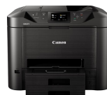
MAXIFY MB5450 series