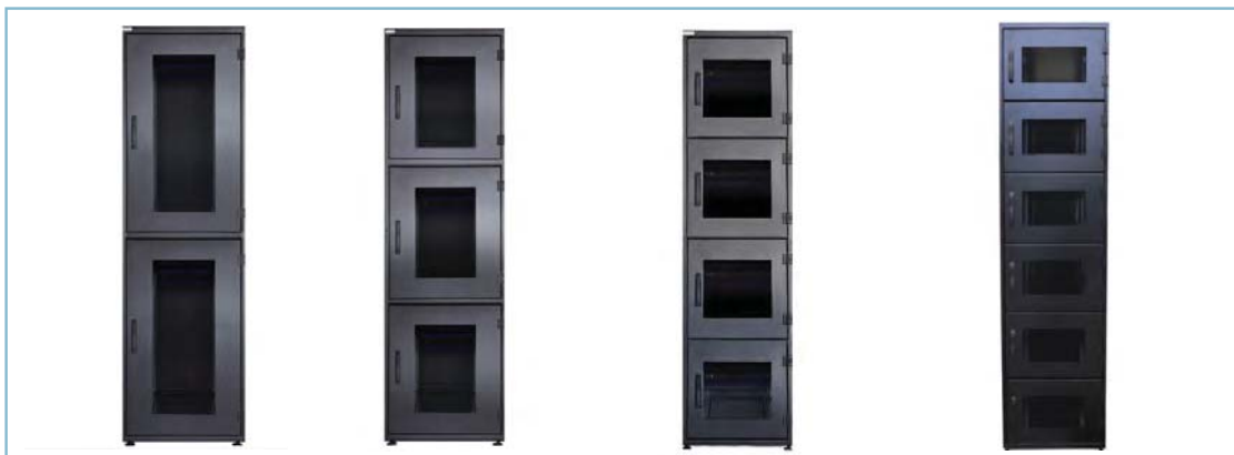
■ Colocation Racks with 1000 mm or 1200 mm depth and 1/2 - 1/3 - 1/4 oder 1/6 segmentation.

Lehmann Colocation Racks are special designed for hosting and data center operators. All Lehmann colocation server racks have separate and lockable perforated metal doors. The individual rack unit / cabinet segments are isolated by special shelves and colocation cable guides. Access from the rack / cabinet area to another is thereby impossible!