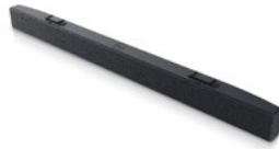
Dell Slim Soundbar - SB521A

An immersive 34" WQHD curved monitor with wide color coverage and extensive connectivity including RJ45, USB-C® and quick-access front ports.