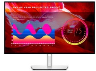
Dell UltraSharp 27 Monitor - U2722D

World's slimmest and lightest soundbar offers exceptional audio clarity and easy magnetic attachment to your Dell monitors, ensuring a clutter-free desk.