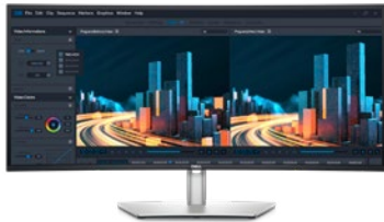
Dell UltraSharp 34 Curved USB-C HUB Monitor - U3421WE

An immersive 34" WQHD curved monitor with wide color coverage and extensive connectivity including RJ45, USB-C® and quick-access front ports.