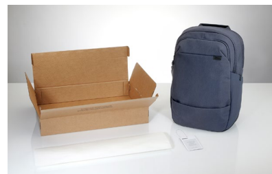
The backpack shown in the image is for illustration purposes only

Packaging is now made from 100% recycled or renewable materials with the elimination of plastic bags. 2