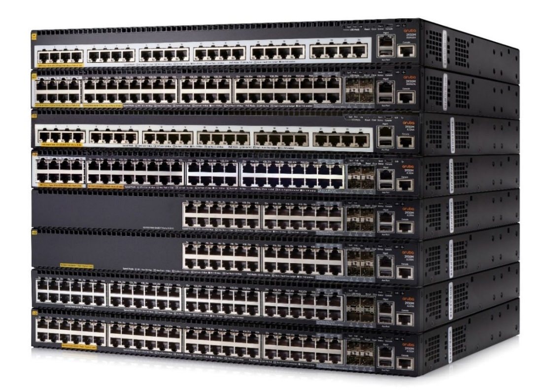
Aruba 2930M Switch Series

The Aruba 2930M Switch Series provides a simple and powerful access layer solution that can be quickly set up at branch offices with little or no IT support using Zero Touch Deployment. The switches include a Limited Lifetime Warranty.