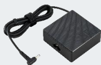
ASUS 90W Universal NB Square Adapter