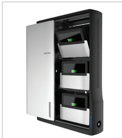
Zip12 Charging Wall Cabinet

Custom country-specific outlet strip includes plenty of space to work with oversized wall adapters and mini-bricks