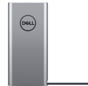
DELL NOTEBOOK POWER BANK PLUS - USB C, 65 WH | PW7018LC

Connect your mouse conveniently via 2.4GHz wireless or Bluetooth and enhance your productivity with programmable shortcut buttons and 36 months 25 of battery life.