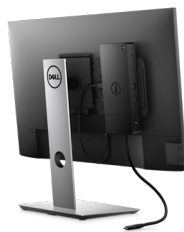
DELL DOCKING STATION MOUNTING KIT | MK15

Work at full speed with Dell's powerful Thunderbolt Dock. Charge your system faster, support up to two 4K displays and connect to your peripherals via a single cable.