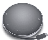
DELL MOBILE SPEAKERPHONE | MH3021P

Designed to work seamlessly across 3 devices, this compact keyboard mouse combo keeps your desk clutter-free and lets you stay productive with up to 36 months 26 of battery life.