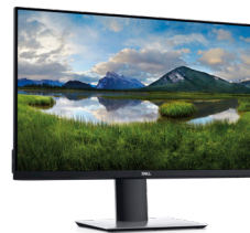
DELL 27 USB-C MONITOR | P2720DC

Easily attach your Dell Dock to the Dell Dock Mounting Kit and mount it behind a monitor, to a wall or under the desk for a clutter-free workspace.