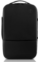
DELL PRO HYBRID BRIEFCASE BACKPACK 15 | PO1520HB

Protect your laptop from impact with this earth friendly backpack that is lined with EVA foam cushioning. Easily convert from backpack to briefcase mode and travel with ease.