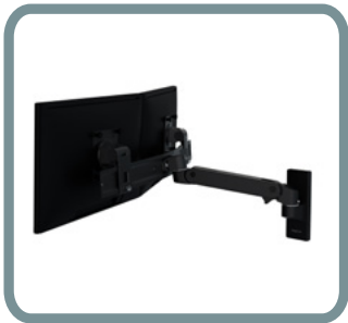
DISPLAY BOW SINGLE TO DUAL DIRECT #98-737