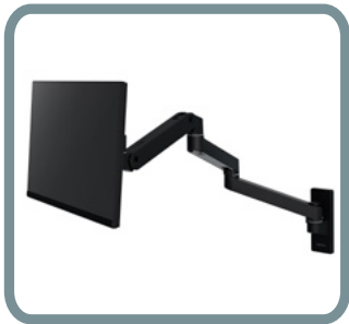
MONITOR ARM EXTENSION #98-731