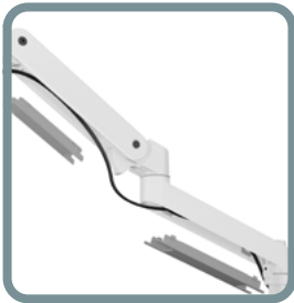
CONVENIENT CABLE COVER: FASTER INSTALLATION AND SLEEKER LOOK