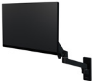
LX Pro Wall Monitor Arm