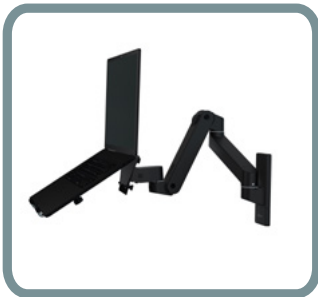
NOTEBOOK TRAY #50-193-200