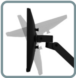
EXTENSIVE TILT RANGE: BETTER ERGONOMICS FOR USERS