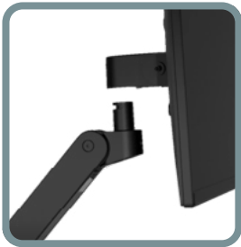
DETACHABLE HEAD: MAKES SET-UP AND MONITOR SWAPS A BREEZE