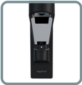
SAVE ROTATION STOP: PREVENT DAMAGE TO WALLS, PARTITIONS, OR CUBICLES