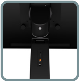
SMART TENSION INDICATOR: SET TENSION LEVEL ONCE AND REPEAT FOR QUICK INSTALL OF MULTIPLE WORKSTATIONS