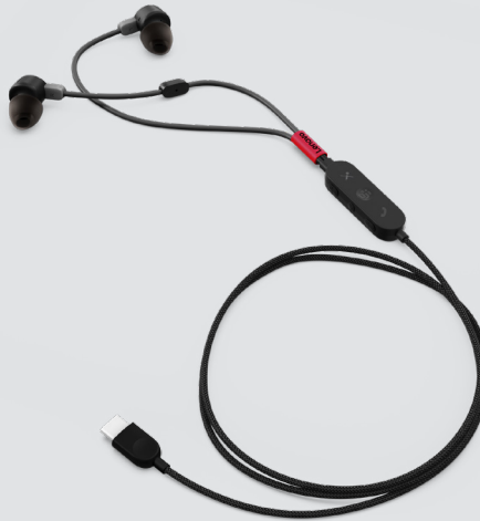
LENOVO GO USB-C ANC IN-EAR HEADPHONES PN: 4XD1C99220

This sleek and stylish full-size mouse design offers exceptional quality in a modern wireless solution. The compact ambidextrous mouse provides excellent portability and perfect ergonomics. Complete tasks with ease using the precise 1200 DPI optical sensor. Connect compatible Lenovo devices with just one nano receiver.