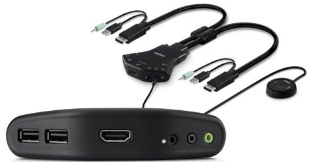
F1DN102N-3 (DP to HDMI)