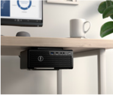
PRECISION COMPACT VESA MOUNT

Securely house the Precision 3240 Compact under your desk with this mount without losing easy access to the Precision's ports. Or securely mount it to the wall for added flexibility.