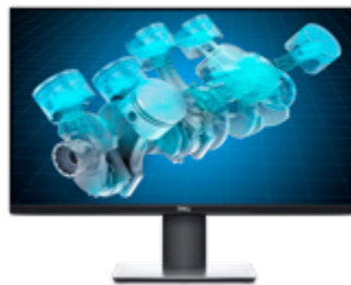
DELL 27 USB-C MONITOR | P2720DC

The monitor stand mount allows the Precision 3240 Compact to be firmly mounted behind all Pro1/1.5 monitor stands and monitors, as shown above (mounted on back of P2720DC monitor).