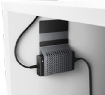
DELL A/C ADAPTER SLEEVE MOUNT

Securely house the Precision 3240 Compact under your desk with this mount without losing easy access to the Precision's ports. Or securely mount it to the wall for added flexibility.