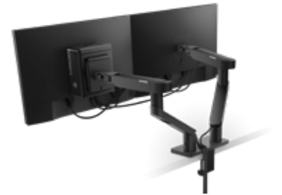
PRECISION COMPACT DUAL VESA MOUNT

Reduce desk clutter with this adjustable mount that securely houses the A/C adapter, per the needs of the user.