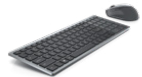
DELL PREMIER WIRELESS KEYBOARD AND MOUSE | KM7120W

Do more with a 27" QHD USB-C® monitor that expands your workspace. Get a better view of all your important tasks while reducing cable clutter.