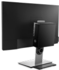
DELL PRO 1/1.5 MONITOR STAND MOUNT

Securely house the Precision 3240 Compact and the monitor using a single or dual monitor arm on your desk with this mount.