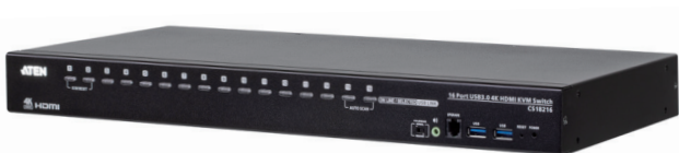
CS18216 Front View