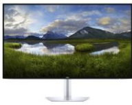
Dell 27 USB-C Ultrathin Monitor - S2719DC