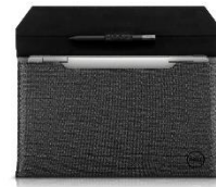
Dell Premier Sleeve - XPS 13