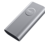
Dell Portable Thunderbolt™ 3 SSD, 500GB (SD1-T0500)(M)