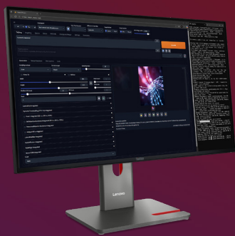
ThinkVision P27Q-40 Display