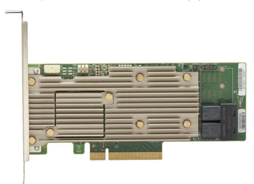
Figure 1. ThinkSystem RAID 930-8i 2GB Flash PCIe 12Gb Adapter

The ThinkSystem RAID 930-8i is shown in the following figure.