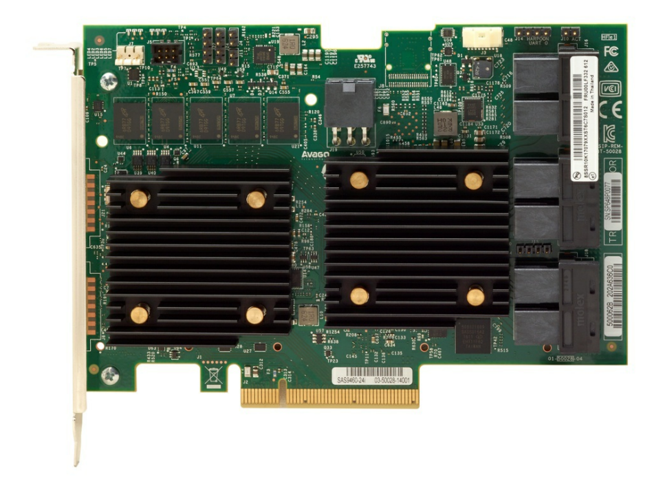
Figure 3. ThinkSystem RAID 930-24i 4GB Flash PCle 12Gb Adapter

The ThinkSystem RAID 930-24i is shown in the following figure.