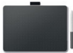
Wacom One M Pen tablet