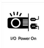
I/O Power On

With the HDMI Power On function, the projector is able to turn on automatically when the projector receives a signal via HDMI or VGA. You no longer need to start the projector separately, but can simply switch on your notebook, receiver or game console and the projector will automatically switch on as well.