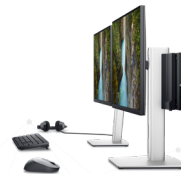
Built for hybrid workspaces

Create a clean work space and reduce cable clutter by mounting your OptiPlex Micro securely behind your monitor with this adjustable, compact stand.