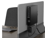
Dell Wall/Under-the-Desk VESA Mount w/ PSU Sleeve

Completely open your workspace with a behind-the-monitor mounting solution. Use with Dell MSA20 or Dell MDA20 for ultimate support.