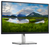
Dell 27 Monitor - P2723D

Stay focused on a 27-inch QHD monitor optimized to deliver high performance details and clarity.