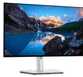
Dell UltraSharp 24 USB-C Hub Monitor - U2422HE

Stay focused on a 27-inch QHD monitor optimized to deliver high performance details and clarity.