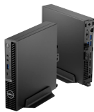
Dell Vertical Desktop Stand

Vertically position your system on your desktop for added stability.