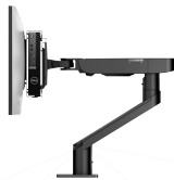
Dell Single Monitor Arm - MSA20

Easily mount your micro to select Dell E-Series monitors.