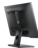
OptiPlex Micro All-in-One VESA Mount for E-Series Monitors with Base Extender

Mount your system on a wall or under a surface while securing the system's power adapter.