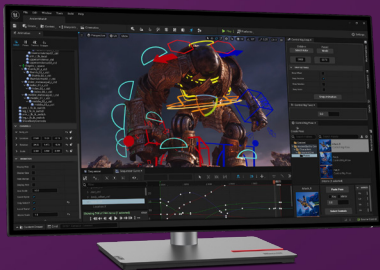
ThinkVision P27h-30 Display