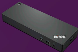
ThinkPad Workstation Thunderbolt™ 4 Dock PN: 40B00300xx