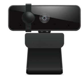
Lenovo FHD Webcam (PN: 4XC1B34802)

An on-ear business-ready stereo USB Headset with a rotatable boom microphone and passive noise cancellation—it is perfect for calls and remote collaboration. Its memory foam and leather earcups make it light and comfortable enough to wear and use all day. 30mm drivers with neodymium magnets deliver excellent audio, while its adjustable headband and boom mic allow either left-side or right-side wearing.