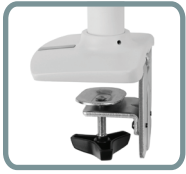
INCLUDED: STANDARD 2-PIECE DESK CLAMP ATTACHES TO SURFACE EDGE