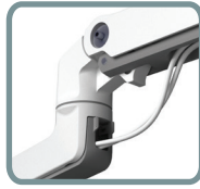
CABLES ROUTE BENEATH THE ARM, OUT OF THE WAY