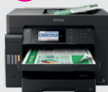
EcoTank ET-16600 Series