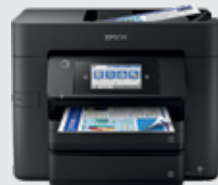
WF-4000 Pro Series