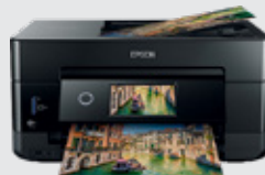
Premium XP-7100 Series