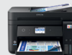
EcoTank ET-4850 Series