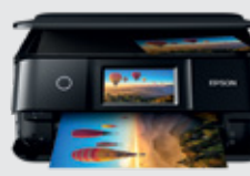
Photo XP-8700 Series