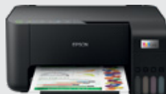
EcoTank ET-2810 Series