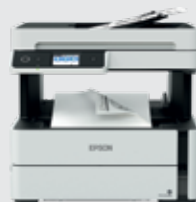
EcoTank ET-M3100 Series