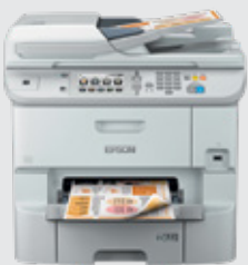
WF-6000 Pro Series