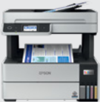
EcoTank ET-5100 Series