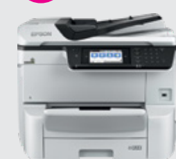
WF-8000 Pro Series