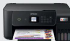
EcoTank ET-2820 Series