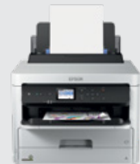
WF-C5000 Pro Series