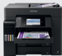
EcoTank ET-5800 Series