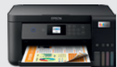
EcoTank ET-2850 Series