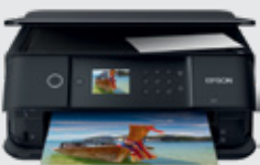
Premium XP-6100 Series