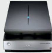
Perfection V850 Pro