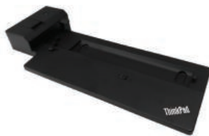
ThinkPad® Pro Docking Station