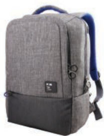
Lenovo On Trend Backpack