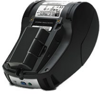
Only available on ZQ610 Plus and ZQ620 Plus

The Extended Capacity PowerPrecision+ battery option provides enhanced battery capacity over the standard PowerPrecision+ battery, providing more power for increased uptime. No need to upgrade your ZQ600/ZQ600 Plus Series printer to accommodate the extended battery—just purchase as a standalone accessory to use with your current ZQ600/ZQ600 Plus Series printer or, order it as a configurable printer option so your printer ships ready to go with this powerful accessory. The choice is yours.