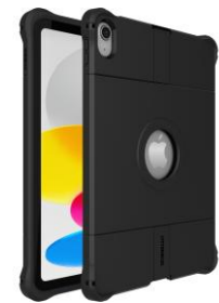
Black 77-89980 (ProPack) 840262399937

Expand your iPad features with OtterBox Universe Case System. Universe features two slotted rails and a center mount, letting you securely attach and easily swap out powerful partner accessories without removing your case. The tablet case offers an additional attachment point at the center for mounting solutions.