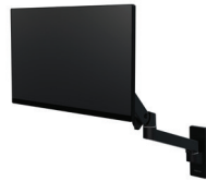
LX Pro Wall Monitor Arm