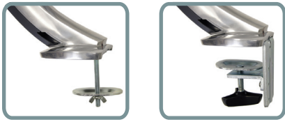
MOUNT TO YOUR DESK WITH EITHER A GROMMET MOUNT OR A DESK CLAMP