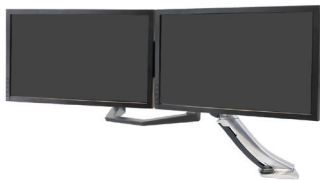
DUAL MONITOR & HANDLE KIT (BLACK) 97-718-009