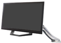
MONITOR & HANDLE KIT (BLACK) 97-760-009