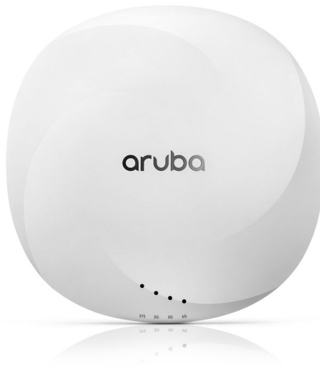
HPE Aruba Networking 630 Series Campus Access Points

For enterprises who need more wireless capacity and wider channels, HPE Aruba Networking 630 Series Campus Access Points are designed to take advantage of the 6 GHz band via three dedicated radios. By using the 6 GHz band, capacity is more than doubled – so you can meet growing demand due to bandwidth-hungry video, increasing numbers of client and IoT devices and growth in cloud. Unique to HPE Aruba Networking, the HPE Aruba Networking 630 Series Campus Access Points includes ultra tri-band filtering and dual 2.5 Gbps ethernet ports to eliminate coverage gaps, provide greater resiliency, and deliver fast, secure connectivity