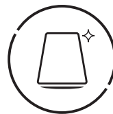
All New Design Innovation, Dare To Go Big