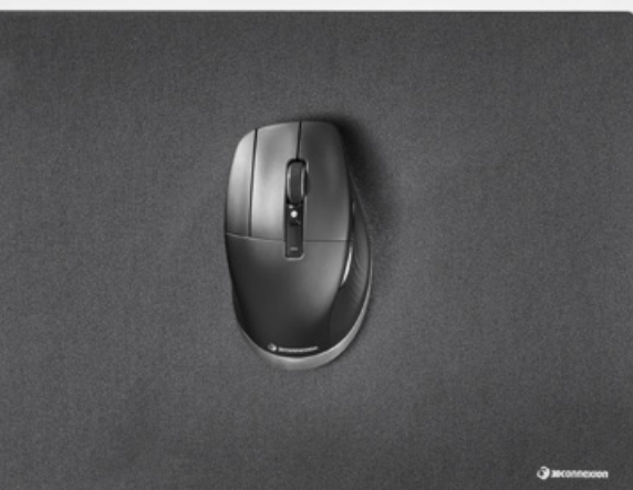
CadMouse Pro Wireless Left, CadMouse Pad

Left-side solution also available: CadMouse Pro Wireless Left