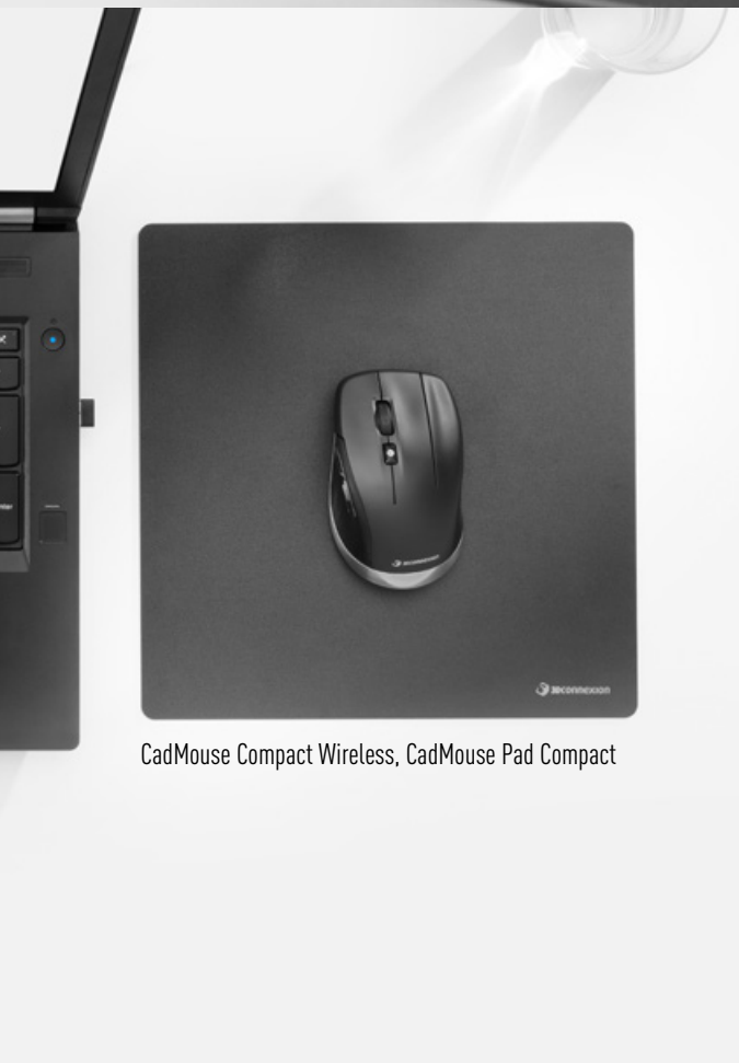
CadMouse Compact Wireless, CadMouse Pad Compact

Dedicated Middle Mouse Button – the days of clicking the mouse wheel are over thanks to the CadMouse's intelligent ergonomic design.