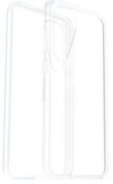
Clear 77-97439 (Retail) 840304784608 77-97589 (ProPack) 840304789047