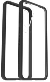
Black Crystal 77-97443 (Retail) 840304785063 77-97591 (ProPack) 840304789085