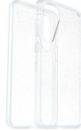
Stardust 77-97441 (Retail) 840304785100 77-97590 (ProPack) 840304789061